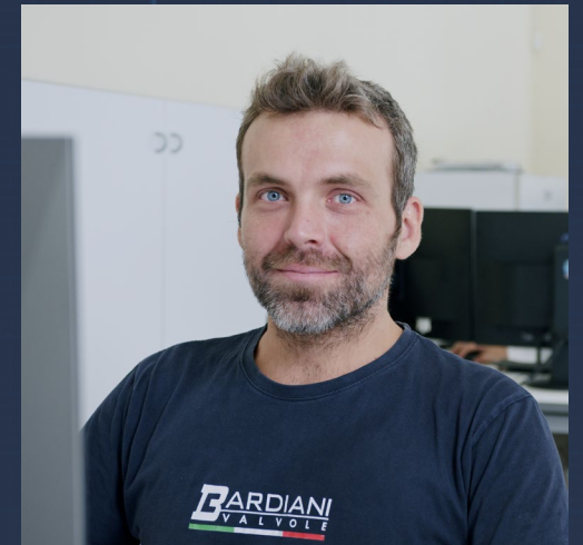
RELIABILITY AND SERVICE