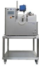
HT122 Mini HTST/UHT

Compact, Ideal for Labs in Development Phase