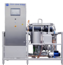
HT326 HTST/UHT Pilot Systems with SSHE

Limitless Potential, Designed to Process Product with Particles