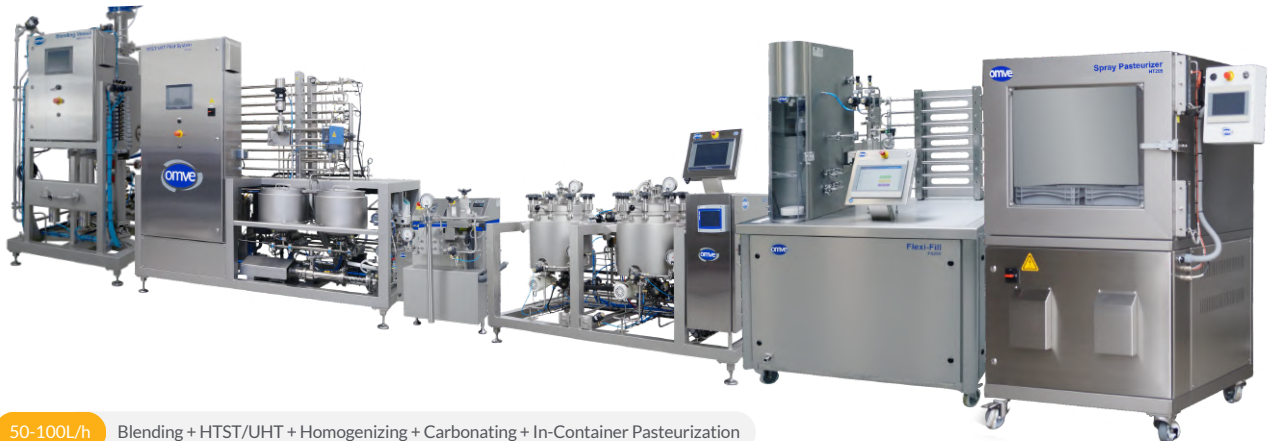
50-100L/h Blending + HTST/UHT + Homogenizing + Carbonating + In-Container Pasteurization