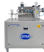
HT323 Pilot DSI Add-On

Reliable. Manual or Automated Critical Control Points