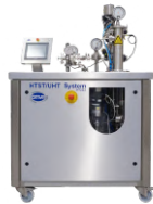
HT223 Lab DSI Add-On

Reliable Manual or Automated Critical Control Points