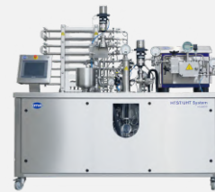
HT220DSI Lab Direct HTST/UHT

Flexible, with Programs to go Indirect or Direct UHT