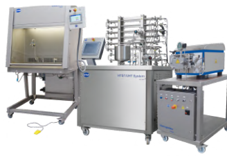
20L/h HTST/UHT + Homogenizing + Filling