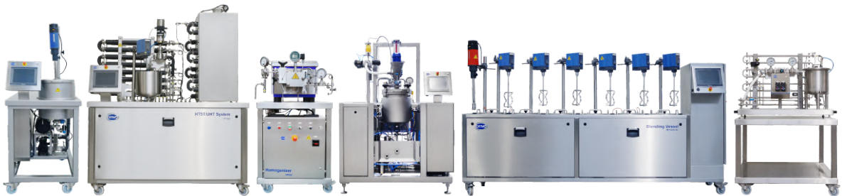
30L/h Blending + HTST/UHT + Homogenizing + Fermenting + Structuring