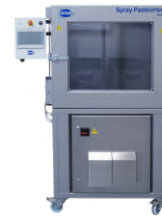
HT205 Spray Pasteurizer

Accurate, Easy Simulation of Tunnel Pasteurizer