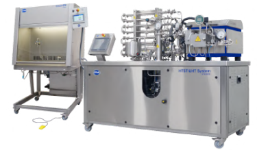
20L/h HTST/UHT Direct & Indirect + Homogenizing + Filling