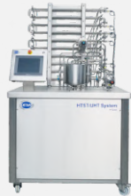
HT220 Lab Indirect HTST/UHT

Robust, High Level of Automation for Reproducibility