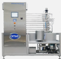
HT320 HTST/UHT Pilot System