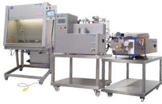
10L/h HTST/UHT + Homogenizing + Filling

Standard & Custom-Made Systems to Match Your Processing Needs