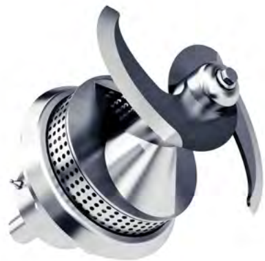
THE MIXING WHEEL

Our customers like us because our mixing technology is unique in all liquid applications. We master the technology to perfection and hereby create unique solutions for the factories we help to create. We are known to be very low maintenance, robust and build to last.