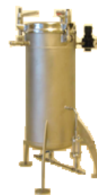
External tank of 15 and 20L for drinkable water