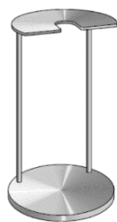
PET bottle neck support