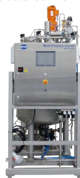
MPV-AB / HB Aseptic Buffer Vessels Hygienic Buffer Vessels