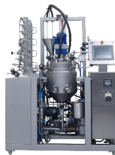
MPV-FE Fermentation Vessel