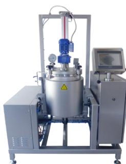
MPV-BC Batch Cooking Batch Processing